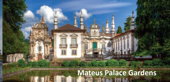
Mateus Palace Gardens