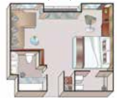
Suite Mozart Deck (284 sf)